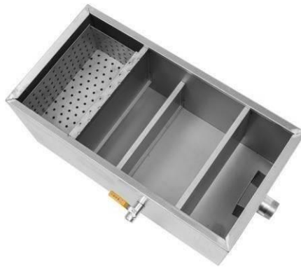
GREASE TRAP (AK-SS2) SIZE: CUSTOMIZED