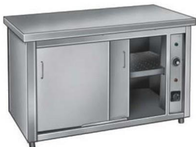
HOT FOOD PICKUP COUNTER SIZE: CUSTOMIZED (AKFSE6)