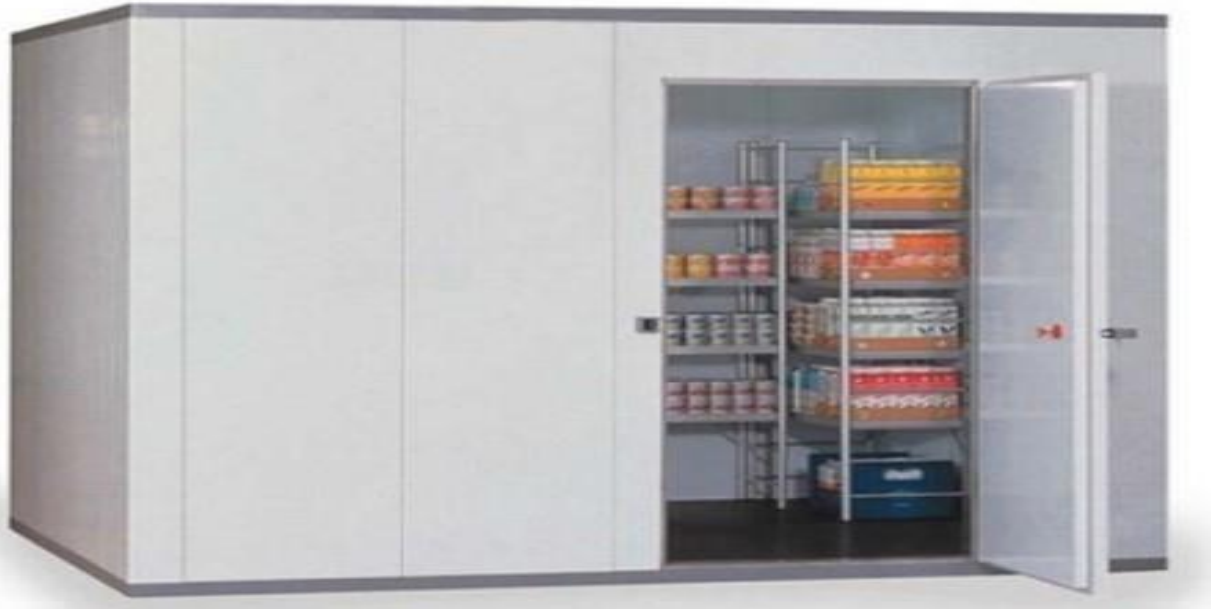
WALK IN CHILLER WALK IN FREEZER SIZE: CUSTOMIZED (AK-SS19)