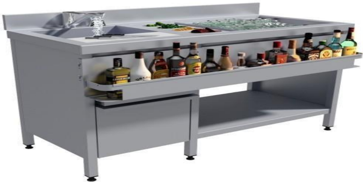
COCKTAIL STATION - (AK-BIE6) SIZE: CUSTOMIZED