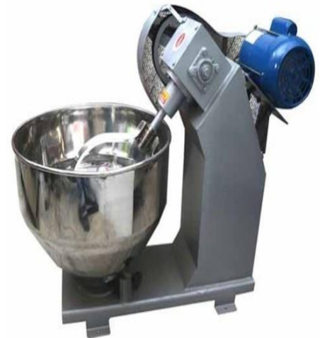
DOUGH KNEADER (ELECTRIC) (AK-PP3) CAPACITY: 5 TO 100 Ltr.