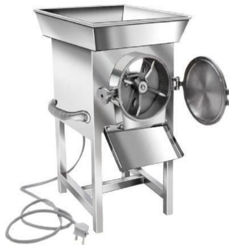
PULVERIZER (ELECTRIC) (AK-PP2) (CAPACITY: 2/3/5/HP)