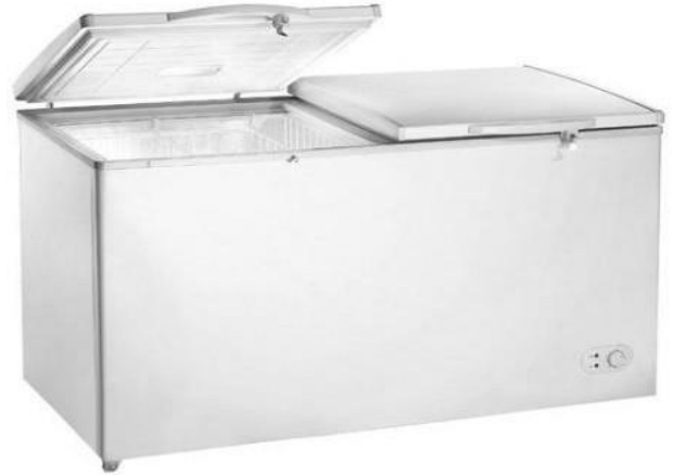
CHEST FREEZER (AK-SS14) CAPACITY: 100 TO 1000 Ltr