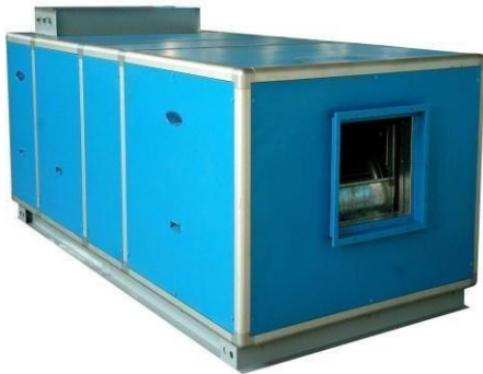
FRESH AIR CENTRIFUGAL BLOWER UNIT CAPACITY: 3 TO 15 HP. (AK-W7)