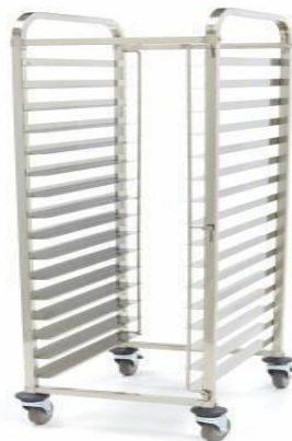
TRAY RACK TROLLEY SIZE: CUSTOMIZED (AKBEQ9)