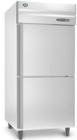
VERTICAL TWO DOOR CITY: 400 TO 600 Ltr (AK-SS18)