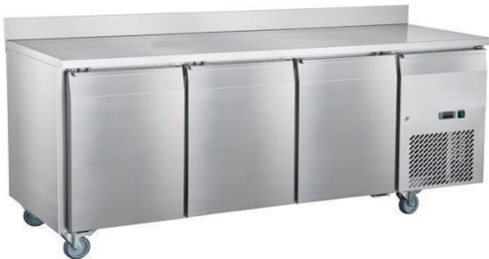
THREE DOORS UNDER COUNTER REFRIGERATOR/ FREEZER SIZE: CUSTOMIZED (AK-SS11)