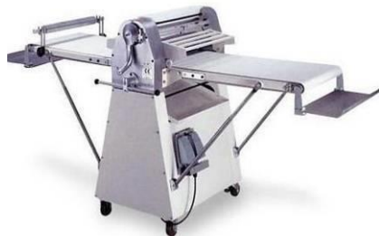
DAUGH SHEETER ELECTRIC (IMP/IND) (AK-BEQ7)