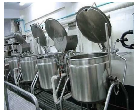
STEEM COOKING VESSELS WITH STEAM GENERATOR (GAS OPERATOR)-(AK-H18) SIZE: CUSTOMIZED