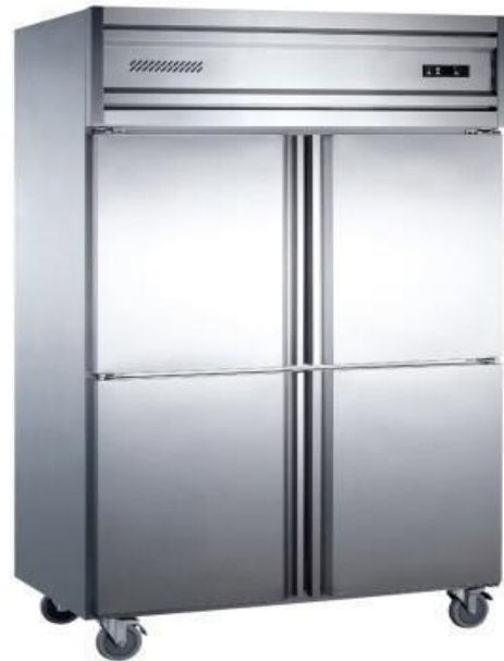
VERTICAL FOUR DOORS SIZE: CUSTOMIZED (AK-SS12)