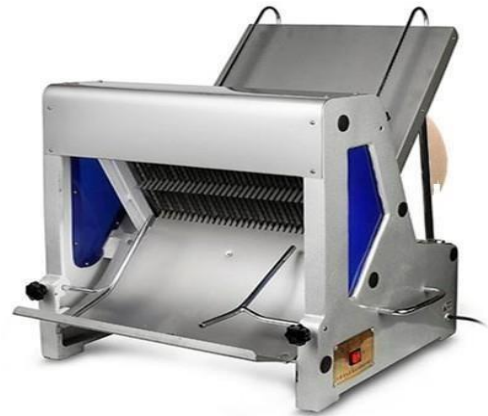
BREAD SLICER (ELECTRIC) TABLE/TOP/ FLOOR MODEL SIZE: CUSTOMIZED (AK-BEQ2)