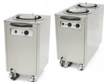
PLATE WARMER (ELECTRIC) SINGLE/DOUBLE (AKFSE7) CAPACITY: 50 TO 100 PLATES