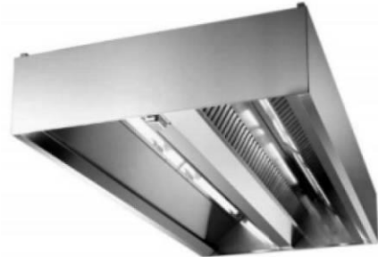
ISLAND EXHAUST HOOD SIZE: CUSTOMIZED (AK-W3)