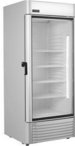
VISI COOLER (AK-SS17) SINGLE DOOR