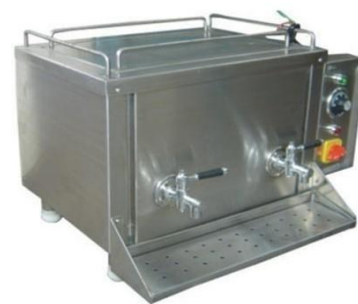
TEA MILK DISPENSER SIZE: CUSTOMIZED (AK-VB5)