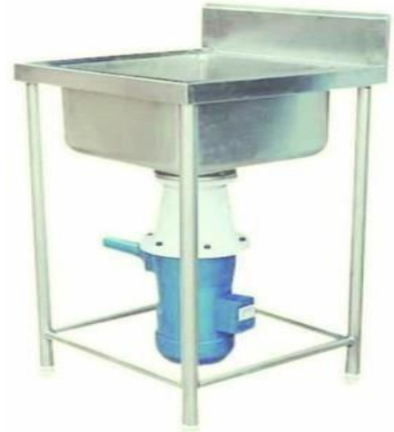
GARBAGE CRUSHER (AK-SS6) CAPACITY: 1 TO 5 HP.