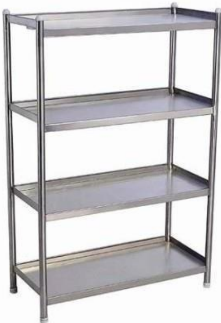
STORAGE / CLEAN DISH RACK SIZE: CUSTOMIZED (AK-Q3)