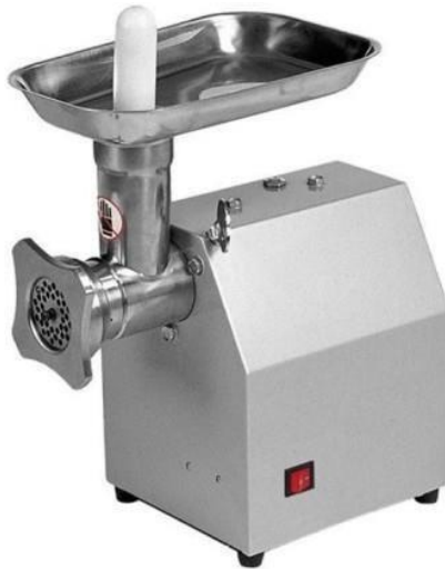
MEAT MINCER (AK-PP8) 1 Kg/Hr