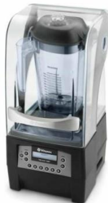
THE QUIET BLANDER