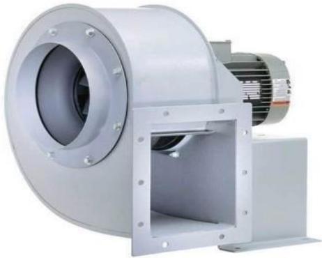
CENTRIFUGAL EXHAUST BLOWER (AK-W2) CAPACITY: 5 TO 15 HP