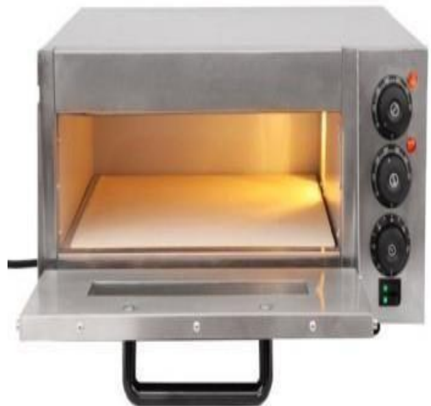
PIZZA OVEN ELECTRIC/GAS (AK-VB9) CUSTOMISED / IMPORTED