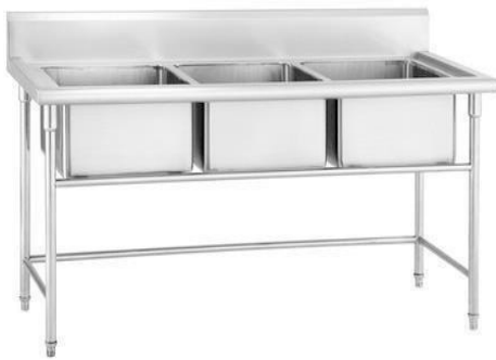
THREE SINK DISH WASH UNIT SIZE : CUSTOMIZED (AK-SS1)