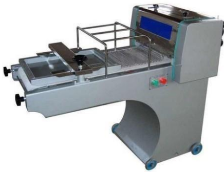
DOUGH MOULDER/IMP SIZE: CUSTOMIZED (AK-BEQ1)