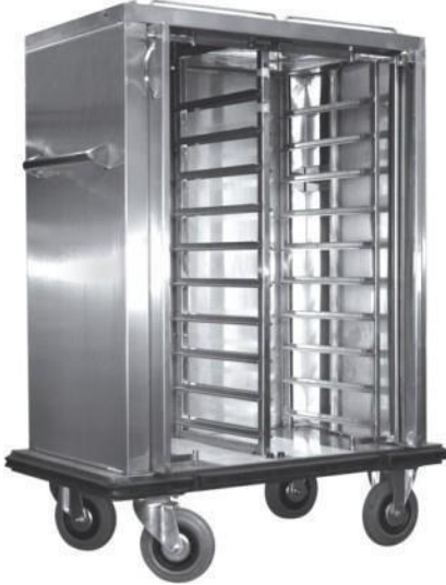
HOT FOOD SERVICE TROLLEY SIZE: CUSTOMIZED (AKFSE8)