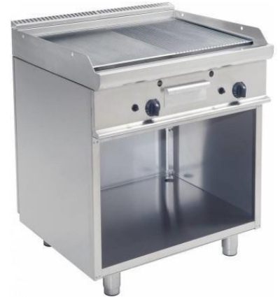
COUNTY GRILL SIZE: CUSTOMIZED (AK-H15)