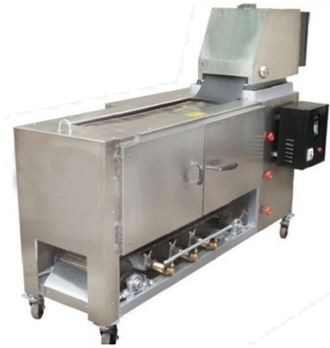
CHAPATI MAKING MACHINE (AK-W6) CAPACITY: 800 TO 1000 CHAPATI/Hr.