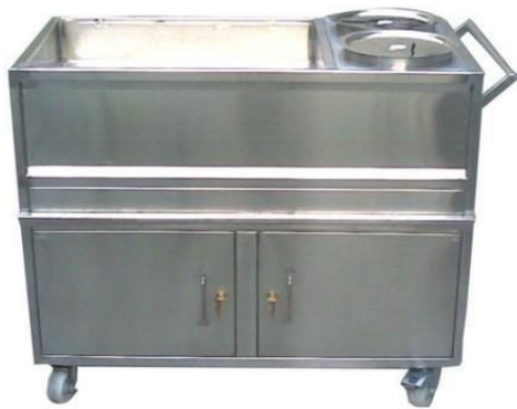
HOT FOOD SERVICE TROLLEY SIZE: CUSTOMIZED (AK-FSE4)