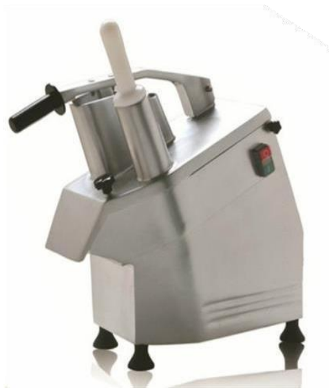
VEGETABLE CUTTING MACHINE (ELECTRIC) (AK-PP5) CAPACITY: 40 TO 200 Kg./Hr.