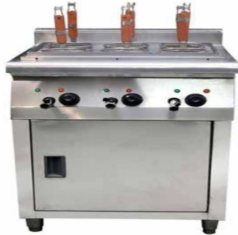
PASTA COOKER SIZE : CUSTOMIZED (AK-H6)