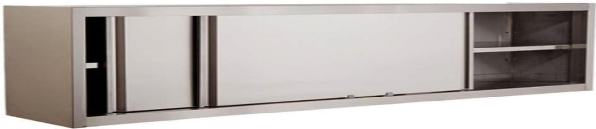
WALL MOUNTED CABINET SIZE: CUSTOMIZED (AK-Q7)