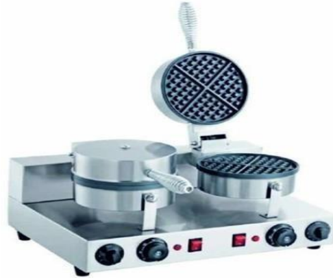
WAFFLE MAKER SINGLE/ DOUBLE (AK-VB7) CUSTOMISED / IMPORTED