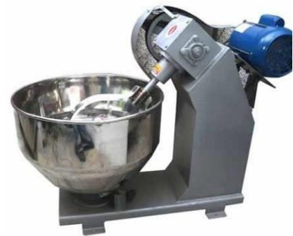
DOUGH KNEADER (ELECTRIC) (AK-W4) CAPACITY: 5 TO 100 Ltr.