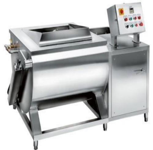
VEGETABLE WASHER SIZE: CUSTOMIZED (AK-PP9) CAPACITY: 40 TO 80 Kg.