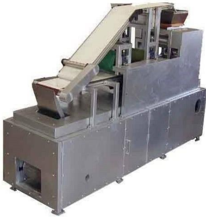
FULLY AUTOMATIC CHAPATI MACHINE (AK-W5) CAPACITY: 1000 TO 4000 CHAPATI/Hr.