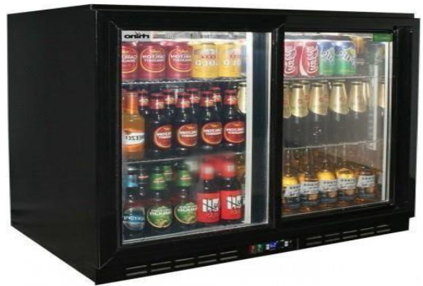
THREE DOOR BACK BAR CHILLER (AK-BIE5) SIZE: STANDARD (IMPORTED)