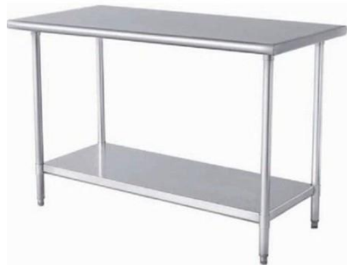
CHAPATI COLLECTION TABLE SIZE: CUSTOMIZED (AK-W9)