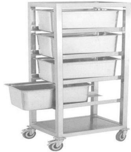
SIZE: CUSTOMIZED (AK-Q2)