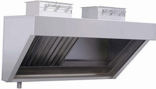
EXHAUST HOOD SIZE: CUSTOMIZED (AK-W1)