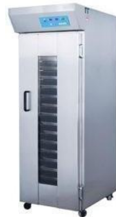
PROOFING CHAMBER SIZE: CUSTOMIZED (AK-BEQ8)