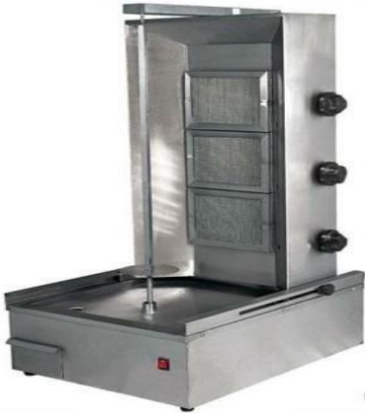
SHAWARMA GRILL (ELECTRIC/GAS) SIZE: 2 TO 4 BURNER (AK-H9)