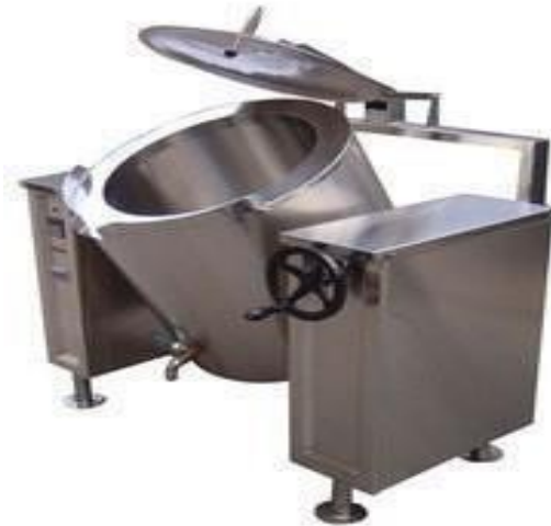
BULK COOKER SIZE: CUSTOMIZED (AK-H8) Y: 50 TO 200 Ltr.