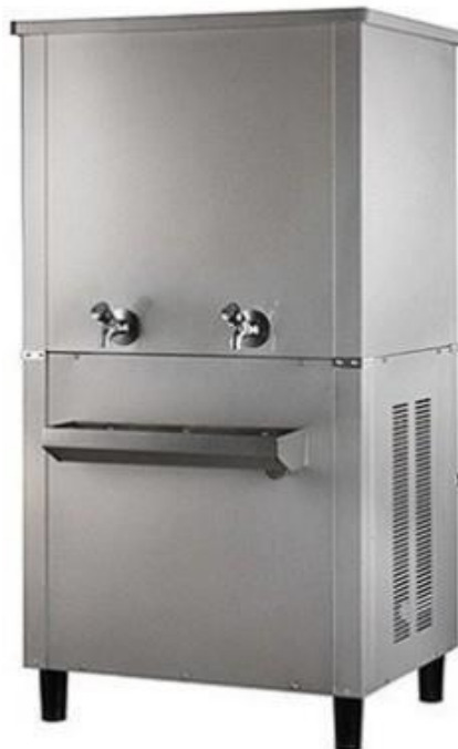
WATER COOLER (AK-FSE9) CAPACITY: 25 TO 1000 Ltr.