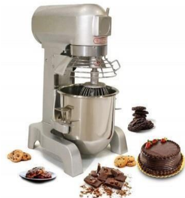
PLANETARY MIXER (IMP/IND) CAPACITY: 5 TO 80 Ltr. (AK-BEQ3)