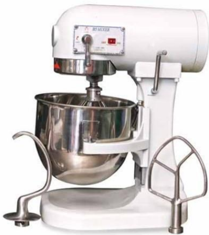
SPIRAL MIXER IMP/IND (AK-BEQ4) CAPACITY: 5 TO 80 Ltr.