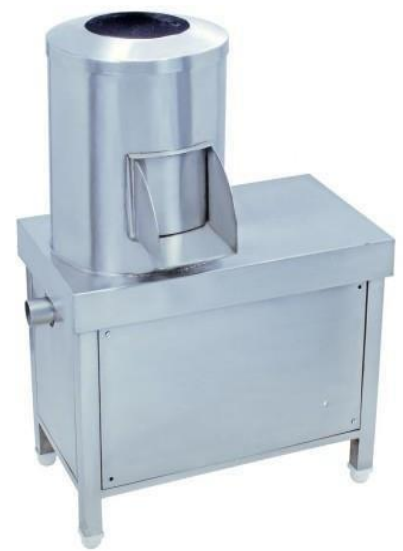
POTATO PEELER (ELECTRIC) - (AK-PP6) CAPACITY: 5 TO 50 Kg.