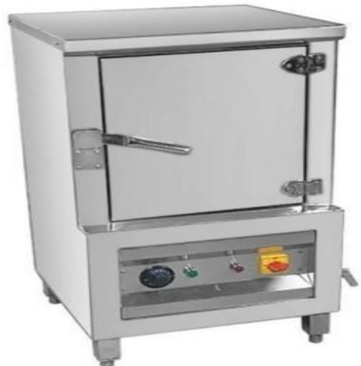
IDLI STEAMER SIZE: (GAS/ELECTRIC) SIZE: CUSTOMIZED (AK-H12) CAPACITY: 36 TO 250 Idli.