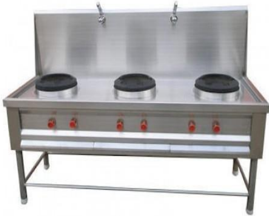
THREE BURNER CHINESE RANGE SIZE : CUSTOMIZED (AK-H5)

akengineeringbalnagar@gmail.com akengineering_hyd@yahoo.com