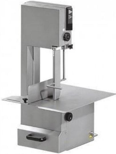
BONESAW (ELECTRIC) (AK-PP7)