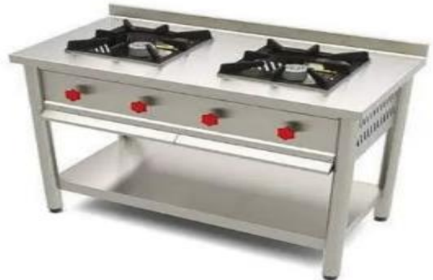
TWO BURNER RANGE SIZE: CUSTOMIZED (AK-H2)