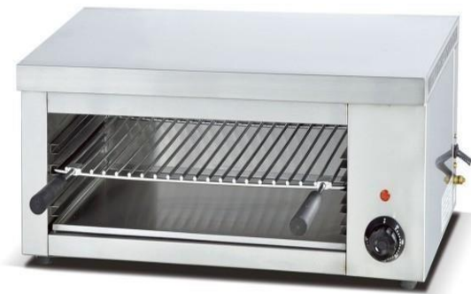
SALAMANDER SIZE : CUSTOMIZED (AK-VB4)