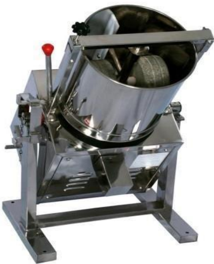
TILTING WET GRINDER (ELECTRIC) - (AK-PP4)