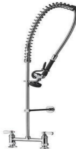
PRE RINSE (AK-SS5) IMPORTED/BRAUNED