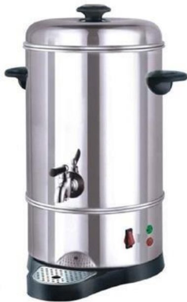
WATER/MILK BOILER (AK-VB8) CUSTOMISED / IMPORTED CAPACITY: 10 TO 40 Ltr.