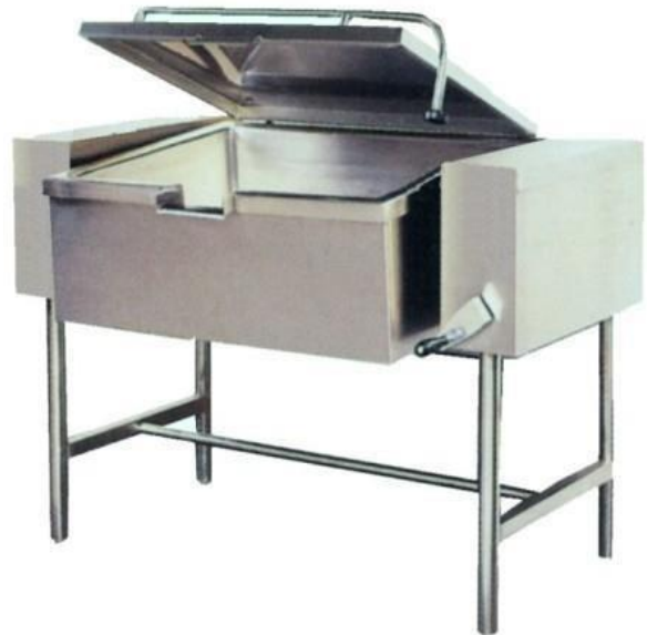
TILTING BRAZING PAN SIZE: CUSTOMIZED (AK-H10) CAPACITY: 52 TO 200 Ltr.