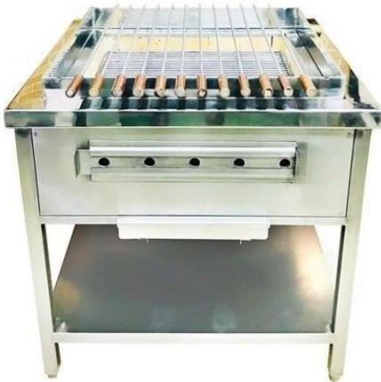
CHCHARCOAL GRILL (GAS/ELECTRIC) (AK-H13) SIZE: CUSTOMIZED