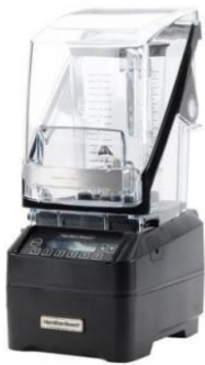
COMMERCIAL SUMMIT BLANDER