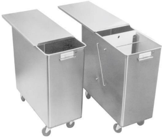
ATTA / MAIDA BIN GN PAN TROLLEY SIZE: CUSTOMIZED (AK-Q1)