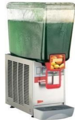
ARCTIC DELUXE 12/1