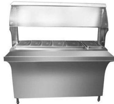
BAIN MARIE FRONT GLASS & TRAY SLIDE SIZE: CUSTOMIZED (AK-FSE3)