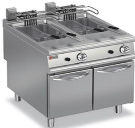
DEEP FAT FRYER (GAS/ELECTRIC) SIZE: CUSTOMIZED (AK-H14) CAPACITY: 8 TO 20 Ltr