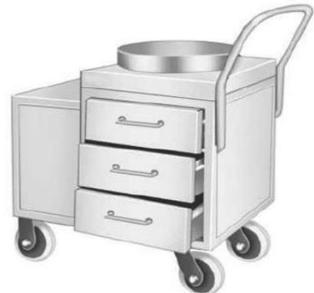
TEA SERVICE TROLLEY (AK-FSE5) SIZE: CUSTOMIZED