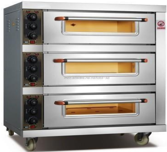
THREE DECK BAKING OVEN GAS/ELECTRIC (IMP/IND) SIZE: CUSTOMIZED (AK-BEQ6)