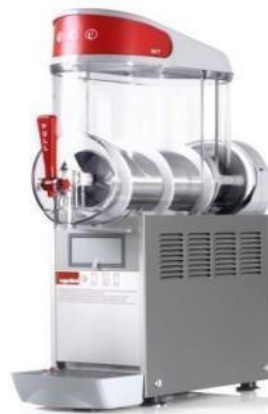
MT 1 MINI