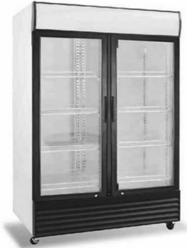
VISI COOLER VERTICAL (AK-SS16) GLASS DOUBLE DOOR