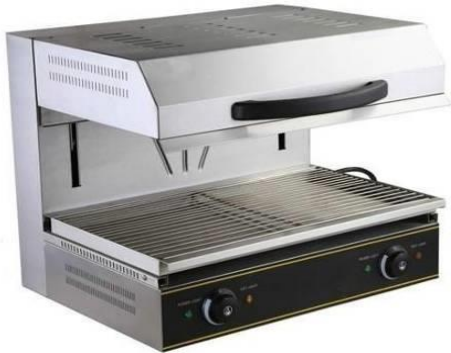
SALAMANDER (AK-VB1) EQUIPMENT

akengineeringbalnagar@gmail.com akengineering_hyd@yahoo.com