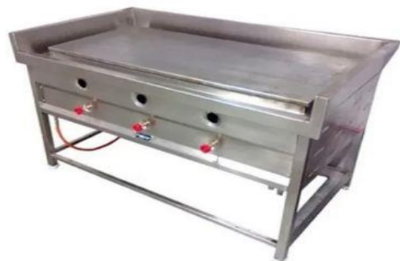
DOSA PLATE SIZE: CUSTOMIZED (AK-H4)