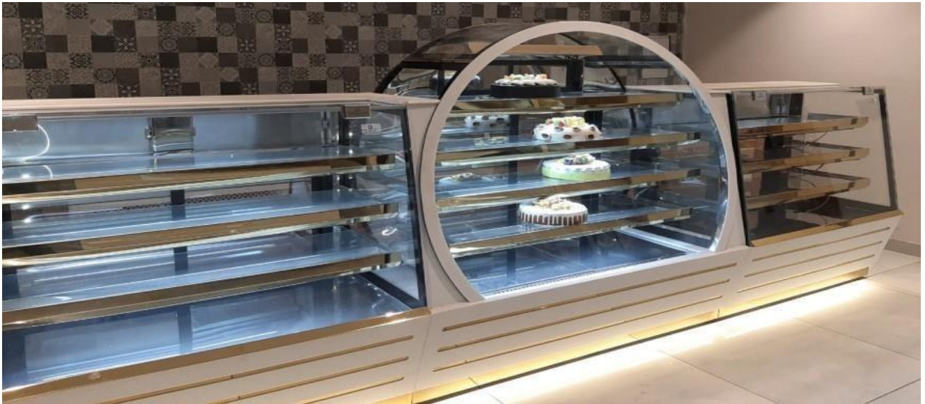
BAKERY / SWEETS DISPLAY COUNTER SIZE CUSTOMIZED (AK-CC7)