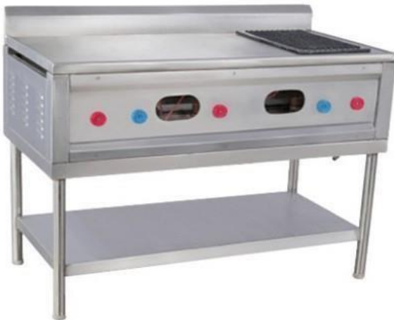
CHAPATI PLATE WITH PUFFER SIZE : CUSTOMIZED (AK-H7)