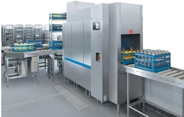
RACK CONVEYOR DISH WASHER (AK-SS8)