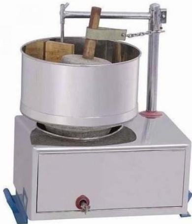
WET MASALA GRINDER (ELECTRIC) (AK-PP1) CAPACITY: 5 TO 25 Ltr.