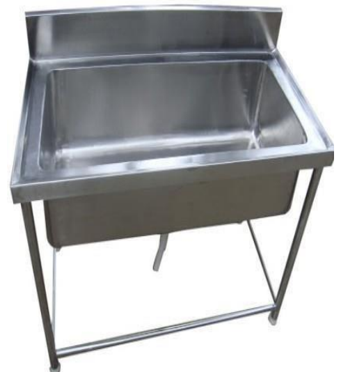
POT WASH UNIT SIZE: CUSTOMIZED (AK-SS7)