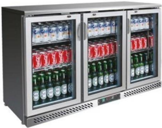
THREE DOOR BACK BAR CHILLER (AK-BIE4) SIZE: STANDARD (IMPORTED)