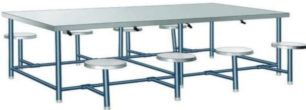
DINNING TABLE WITH SEATER SIZE: CUSTOMIZED (AK-Q8)