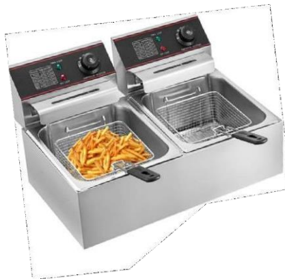
DEEP FAT FRYER(TABLE TOP) SIZE: CUSTOMIZED(AK-H17)