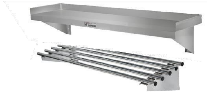
WALL SHELF SIZE: CUSTOMIZED (AK-Q6)