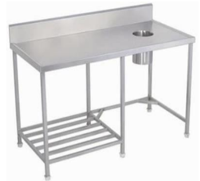
DIRTY DISH LANDING TABLE (AK-SS3) SIZE: CUSTOMIZED