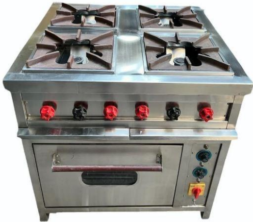
FOUR BURNER RANGE WITH OVEN SIZE: CUSTOMIZED (AK-H1)