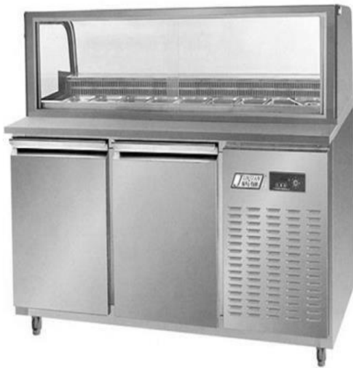
TWO DOOR UNDER COUNTER (PIZZA MAKELINE) REFRIGERATOR/ FREEZER SIZE: CUSTOMIZED (AK-SS10)