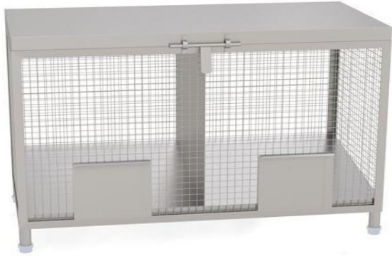
ONION POTATO BIN (AK-Q5) SIZE: CUSTOMIZED