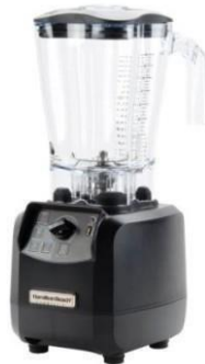
2 SPEED BLANDER