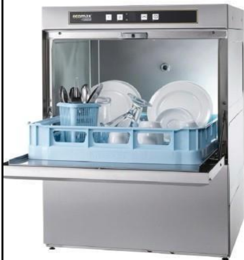
UNDER COUNTER DISHWASHER (AK-SS4) STD/IMPORTED