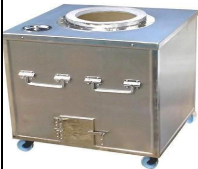
SS MOBILE TANDOOR SIZE: CUSTOMIZED (AK-H16)