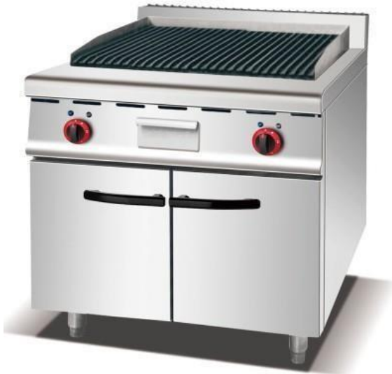
LAVA GRILL (GAS/ELECTRIC) SIZE: CUSTOMIZED (AK-H11)