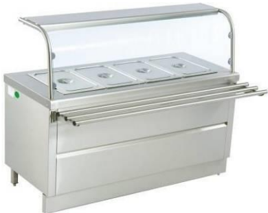
BAIN MARIE (HOT/COLD) FRONT GLASS & TRAY SLIDE SIZE: CUSTOMIZED (AK-FSE1)