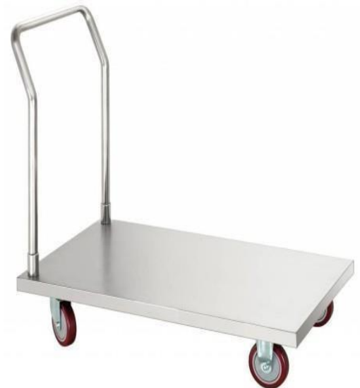
SS PLATFORM TROLLEY SIZE: CUSTOMIZED (AK-Q4)