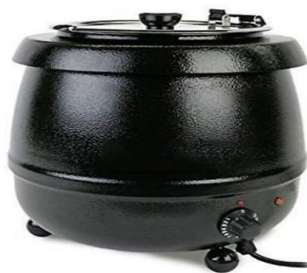
SOUP KETTLE STANDARD/BRANDED (AK-VB8) CAPACITY: 7 TO 15 Ltr