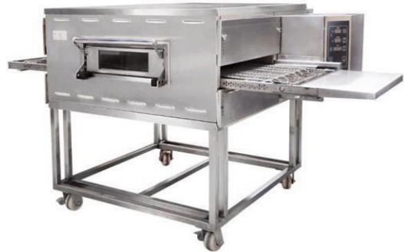
CONVEYOR PIZZA OVEN ELECTRIC/GAS (AK-VB3) INDIAN/IMPORTED EQUIPMENT