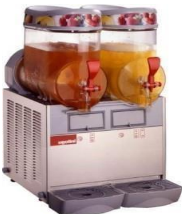
MT 2 GL