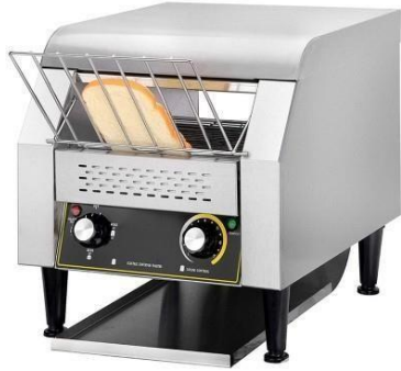
CONVEYOR TOASTER (ELECTRIC) SIZE: CUSTOMIZED (AK-VB6)