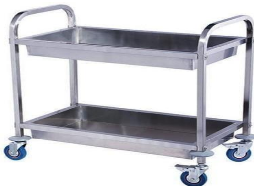
CHAPATI COLLECTION TROLLEY SIZE: CUSTOMIZED (AK-W8)