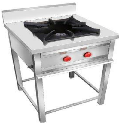
SINGLE BURNER RANGE SIZE: CUSTOMIZED (AK-H3)