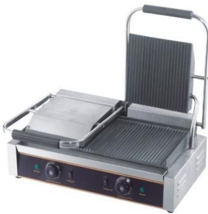
SANDWICH GRILER (ELECTRIC) SINGLE /DOBLE (AK-VB2) (STD/JAMBO)