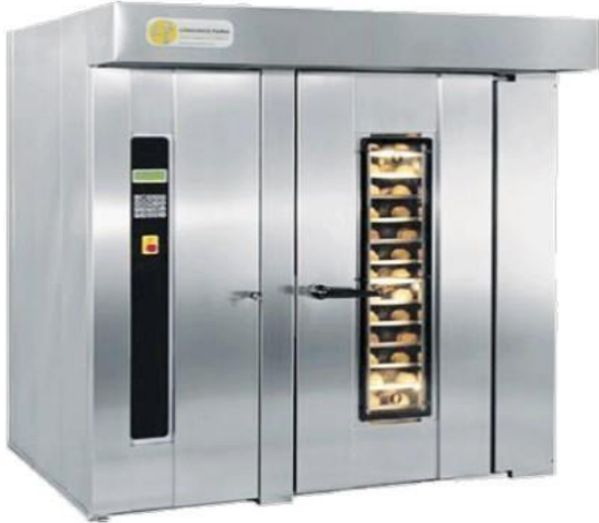
ROTARY OVEN (GAS/ELECTRIC) GAS/ELECTRIC (IMP/IND) SIZE: CUSTOMIZED (AK-BEQ5)