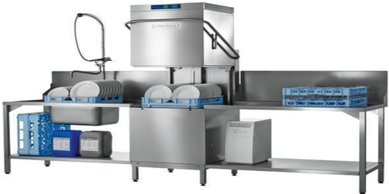
HOOD TYPE DISHWASHER (AK-SS9) CAPACITY: 22 TO 60 RACK/HOUR