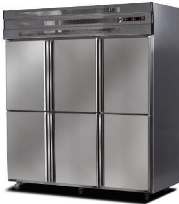
VERTICAL SIX DOOR SIZE: CUSTOMIZED (AK-SS15) CAPACITY: 1800 Ltr.