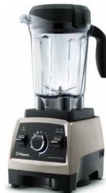
2 SPEED BLANDER