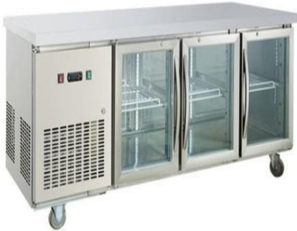
GLASS (DOOR UNDER COUNTER) SIZE: CUSTOMIZED (AK-SS13)